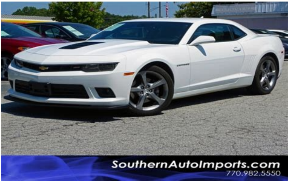
2017 chevy camaro battery location. 2017 chevy camaro ss reliability. 2017 chevrolet camaro ss oil capacity.